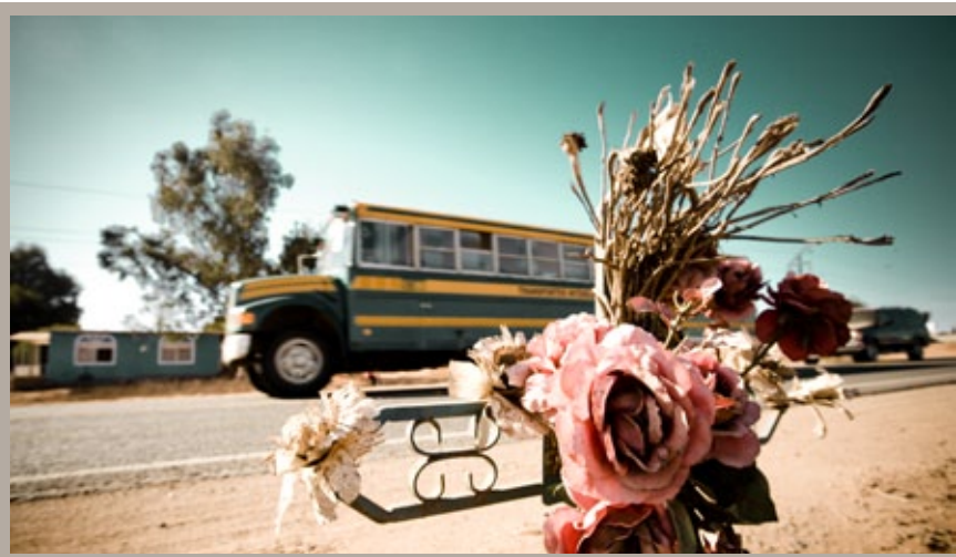
"Vida", Pablo Pro 2008