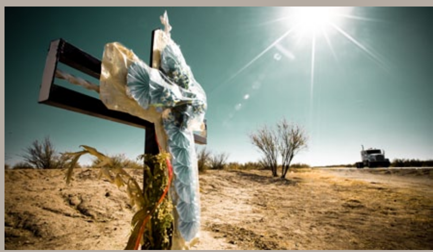
"Vida", Pablo Pro 2008