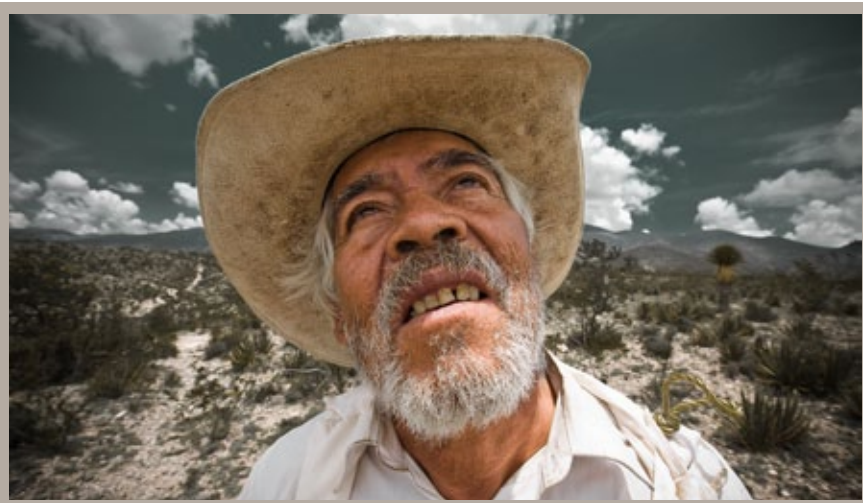
"Rezo", Pablo Pro 2008