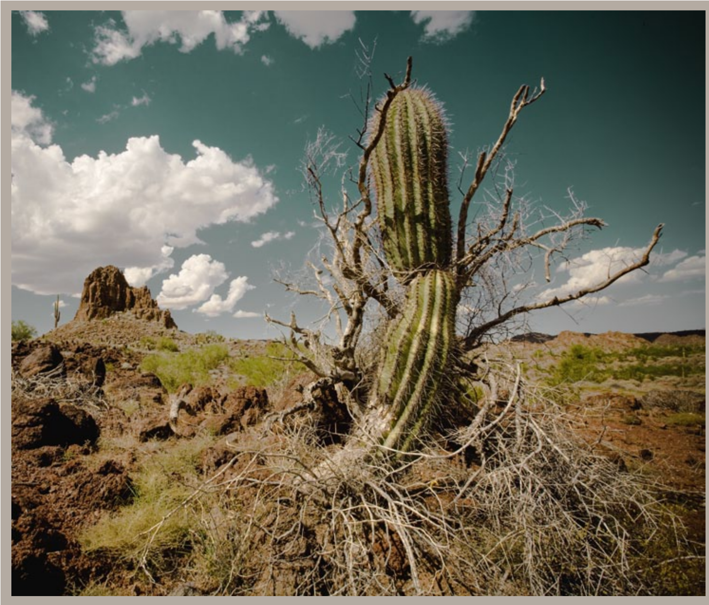
"Semejante", Pablo Pro 2008