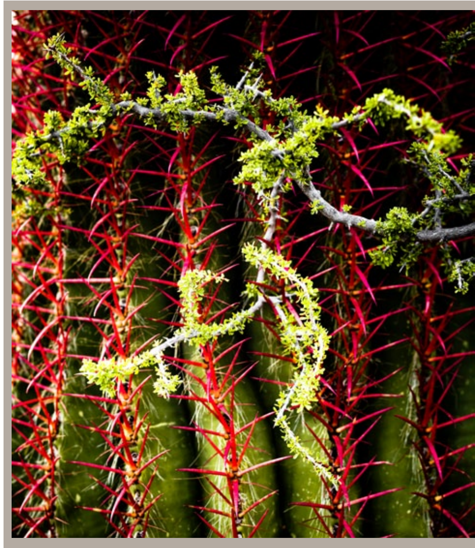
"Integración", Pablo Pro 2008