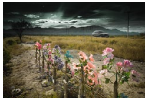
"El amor", Pablo Pro 2008