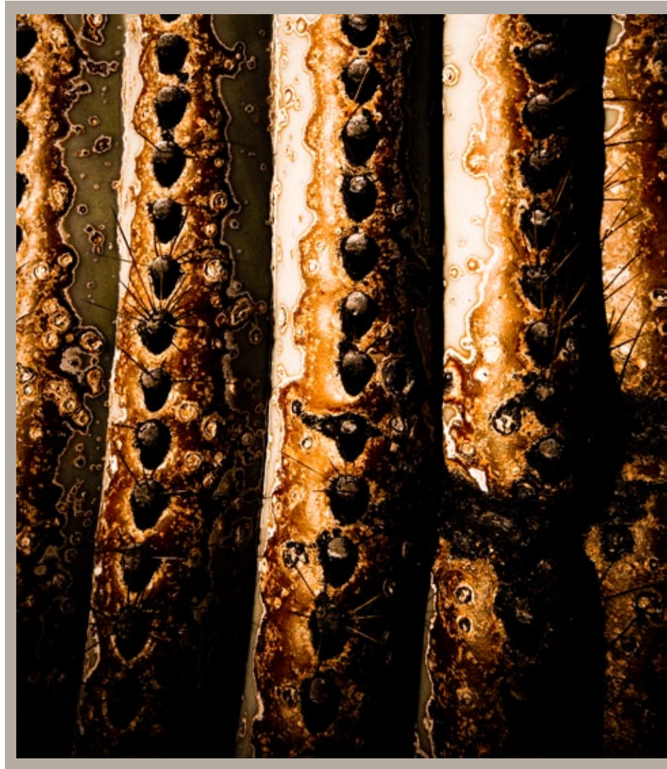
"Vida y muerte", Pablo Pro 2008