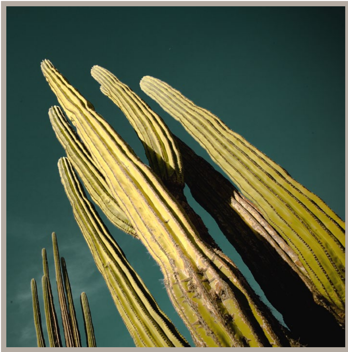
"Toma de conciencia", Pablo Pro 2008