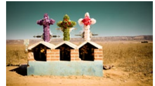
"La vida", Pablo Pro 2008