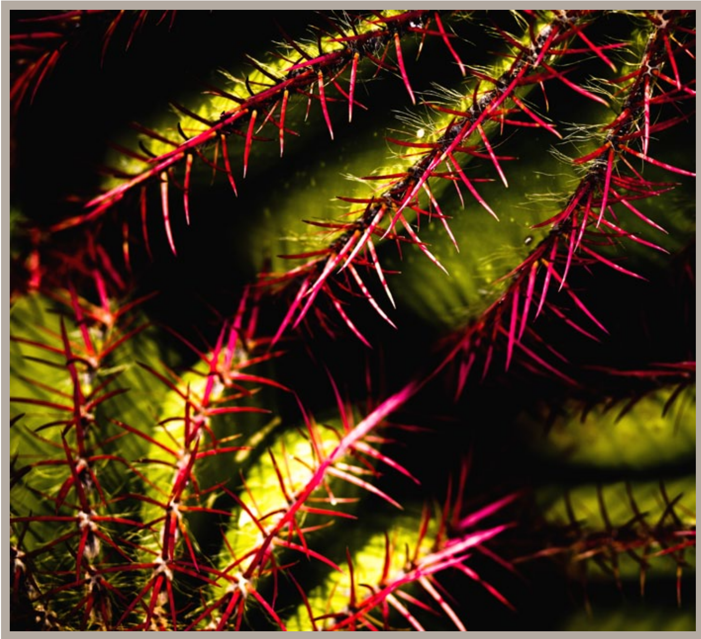
"Despertar", Pablo Pro 2008