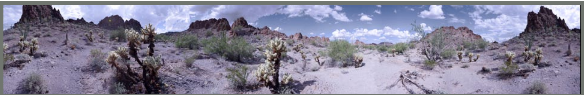
"El Muerto" 2x1, Pablo Pro 2008