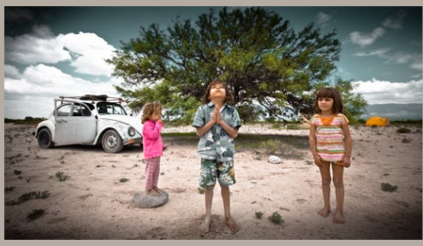
"Rezo", Pablo Pro 2008