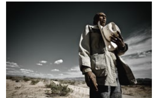
"El rezo", Pablo Pro 2008