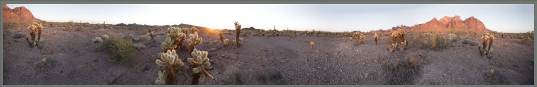
"Ultimo momento" 2x1, Pablo Pro 2008