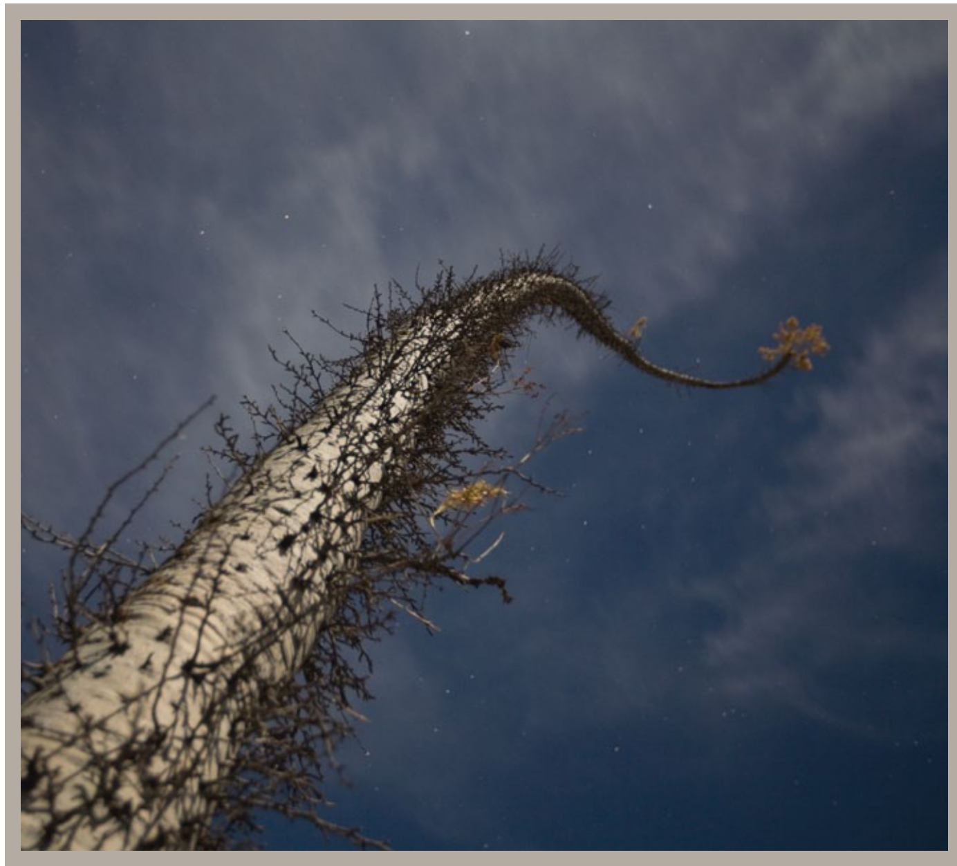
"C3smica", Pablo Pro 2008