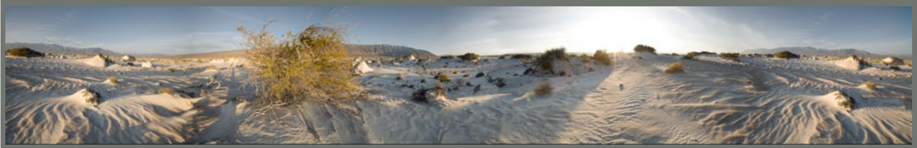
"Soledad" 2x1, Pablo Pro 2008