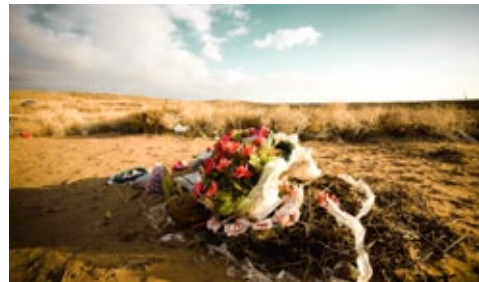
"La muerte", Pablo Pro 2008

"I have the ambitious dream to create portraits of my experiences thru light and the photographic frame. I seek subtleness, the ephemeral, everything that is revealed before the eyes that come across it."