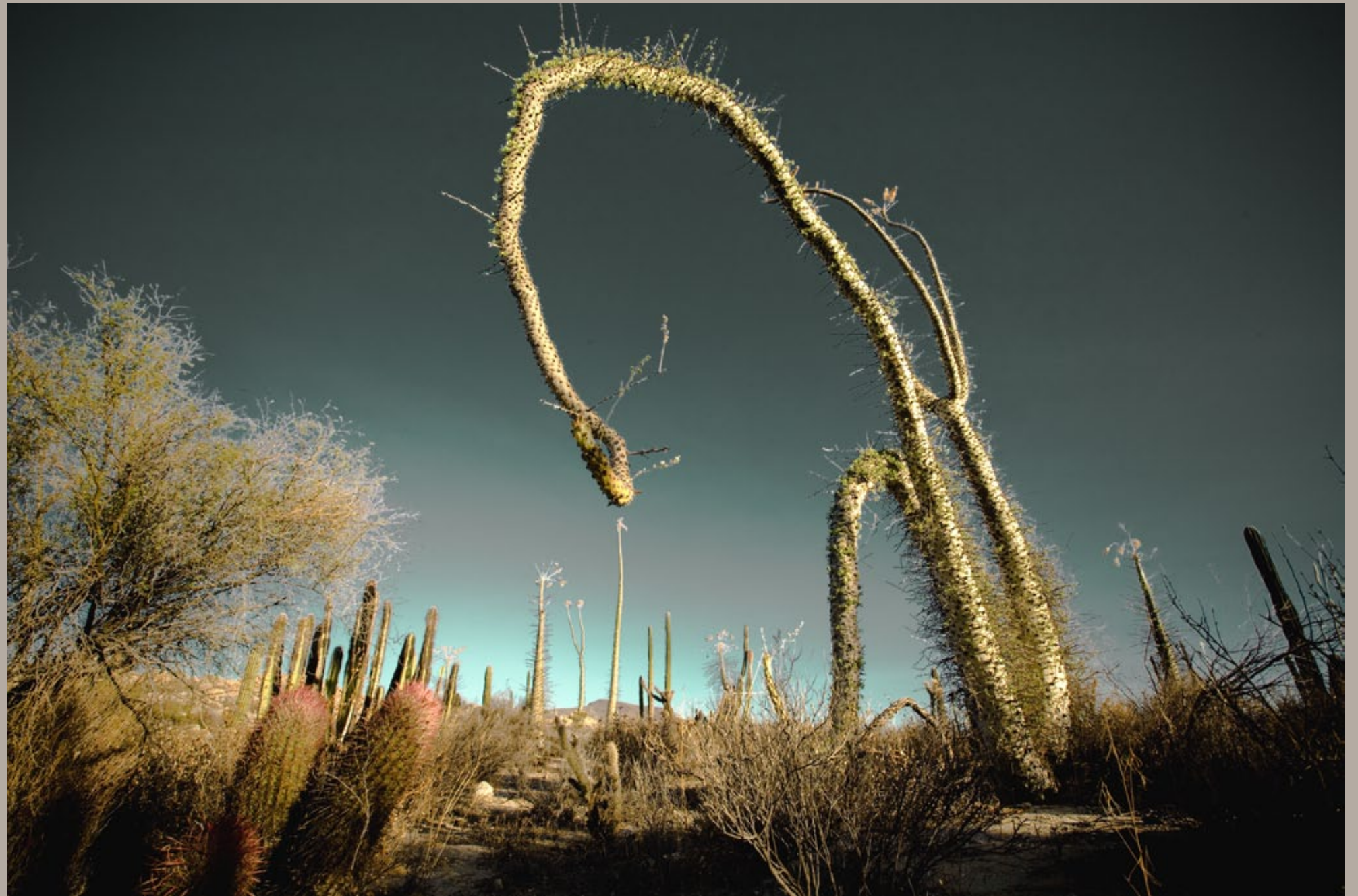
"Percepción", Pablo Pro 2008